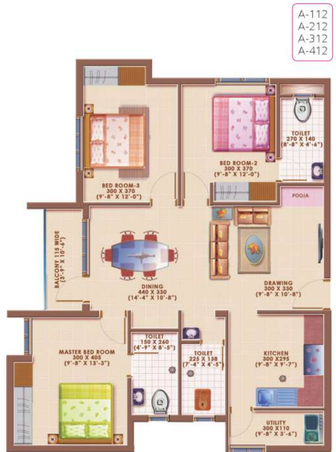
TYPICAL FLOOR PLAN : 1350 SFT (3 BHK APARTMENT)