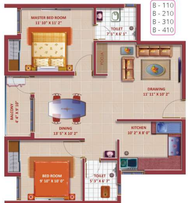
TYPICAL FLOOR PLAN : 1000 SFT (2 BHK APARTMENT)