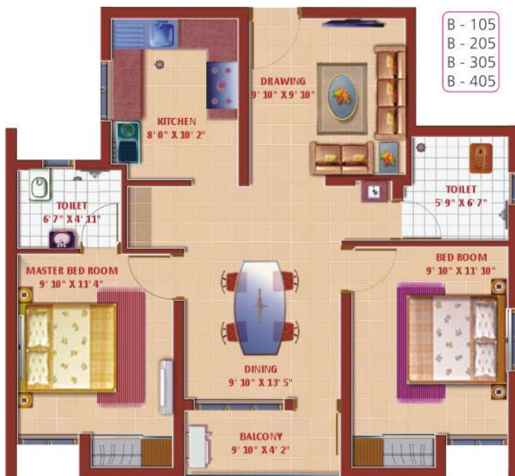
TYPICAL FLOOR PLAN : 984 SFT (2 BHK APARTMENT)