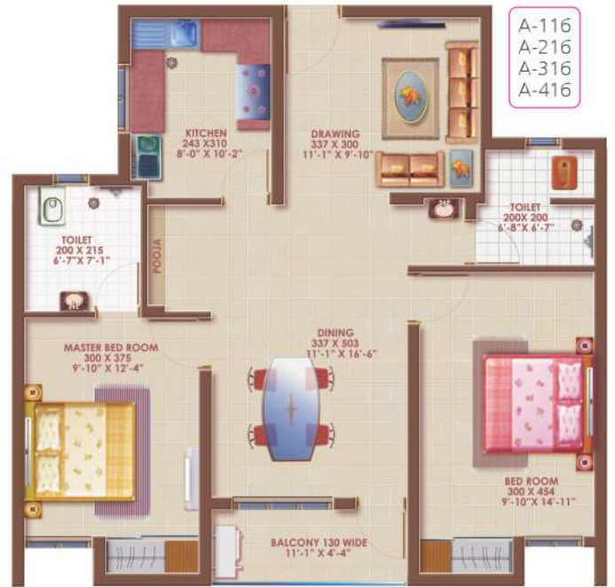
TYPICAL FLOOR PLAN : 1155 SFT (2 BHK APARTMENT)