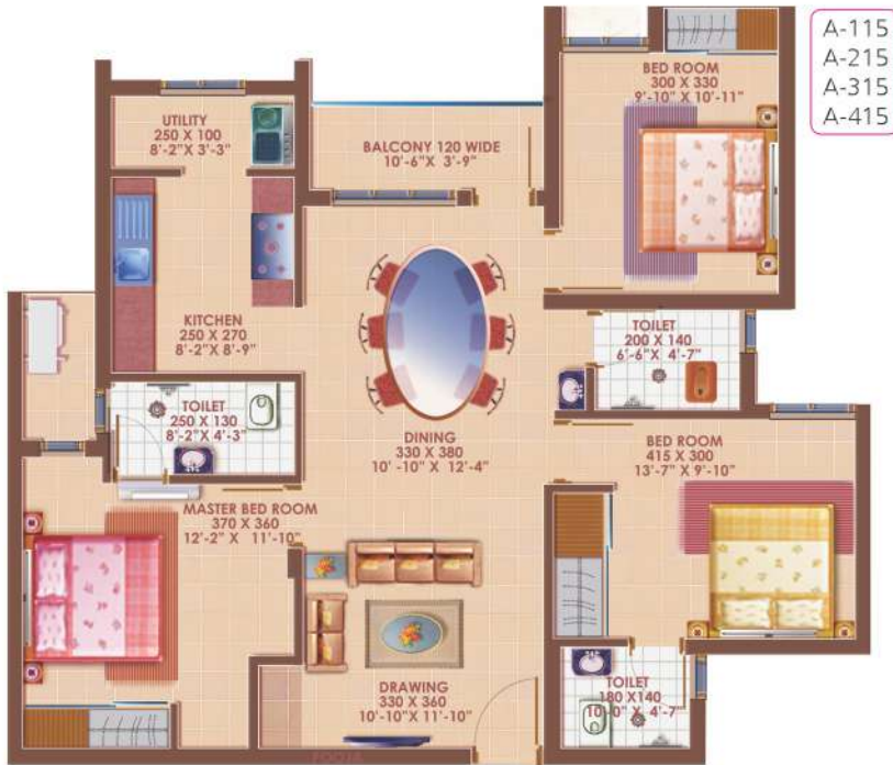
TYPICAL FLOOR PLAN : 1254 SFT (3 BHK APARTMENT)