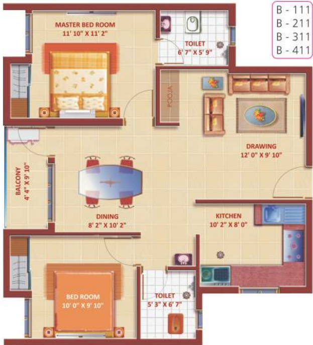
TYPICAL FLOOR PLAN : 996 SFT (2 BHK APARTMENT)