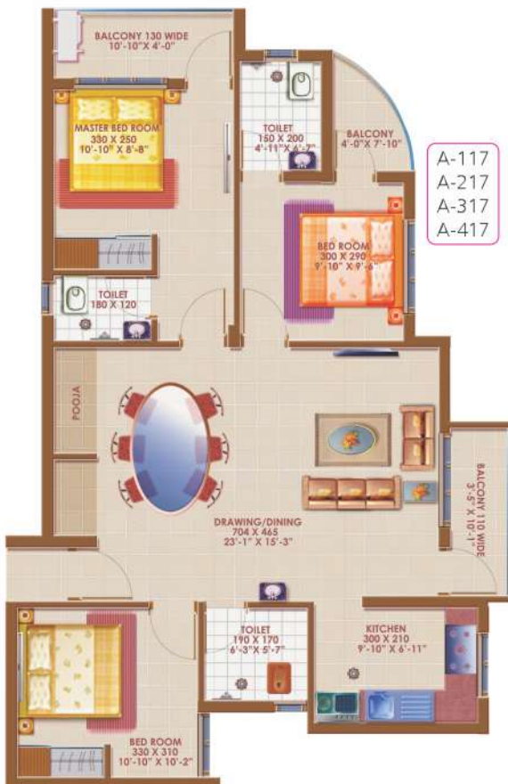
TYPICAL FLOOR PLAN : 1307 SFT (3 BHK APARTMENT)