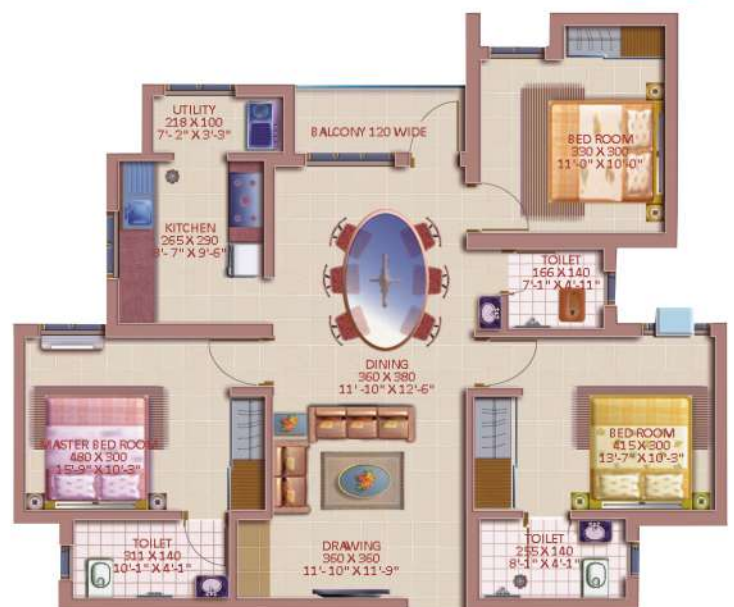
TYPICAL FLOOR PLAN : 1331 SFT (3 BHK APARTMENT)