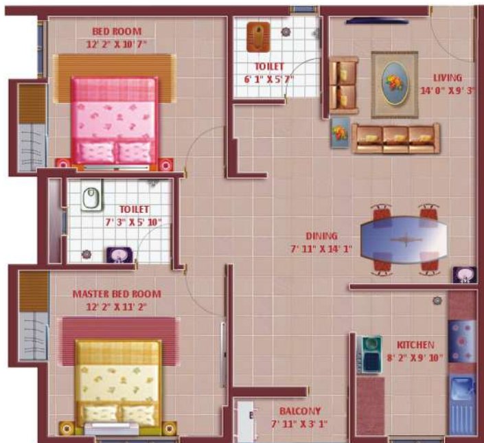
TYPICAL FLOOR PLAN : 1091 SFT (2 BHK APARTMENT)