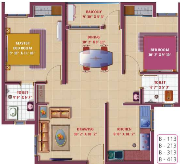
TYPICAL FLOOR PLAN : 976 SFT (2 BHK APARTMENT)