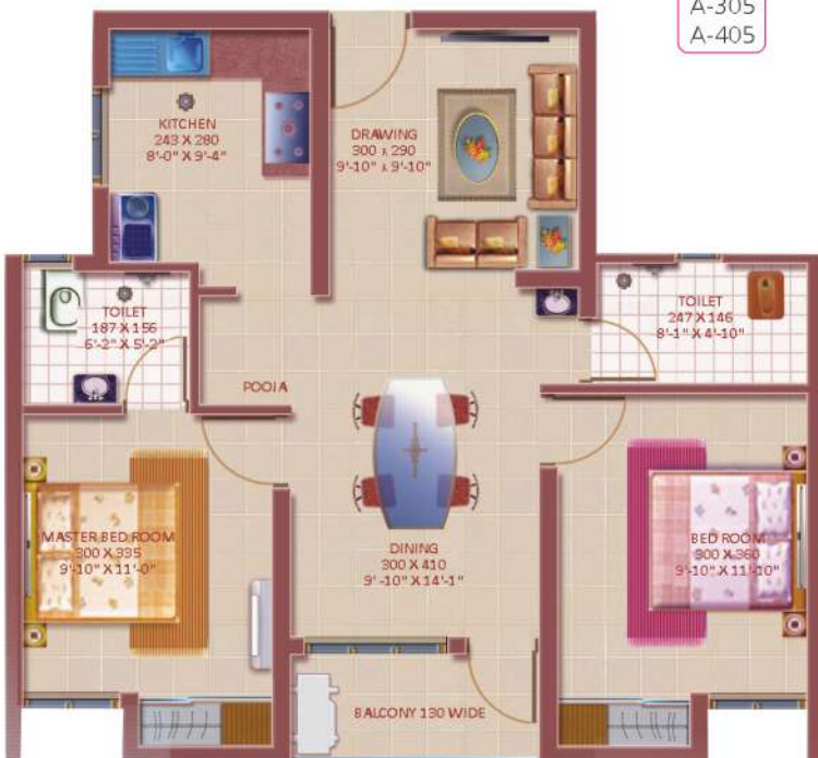
TYPICAL FLOOR PLAN : 966 SFT (2 BHK APARTMENT)