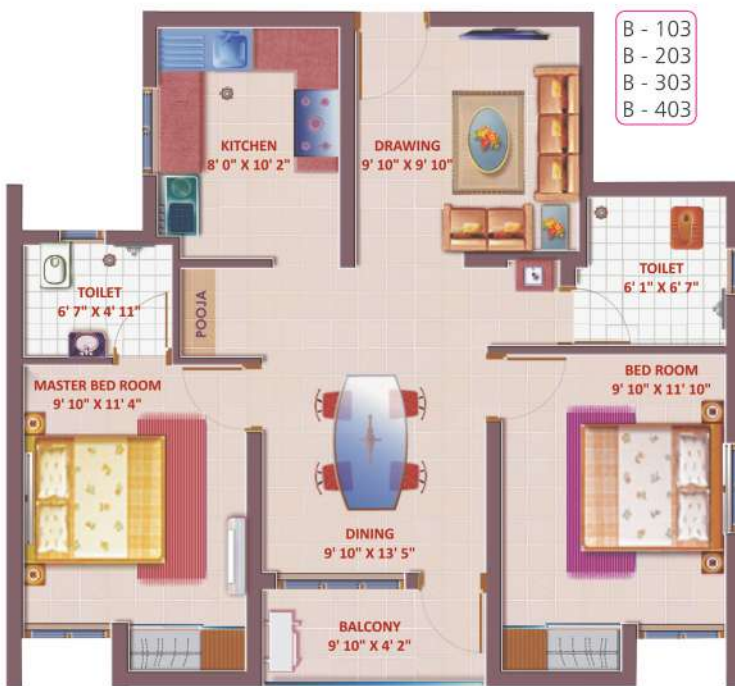
TYPICAL FLOOR PLAN : 984 SFT (2 BHK APARTMENT)