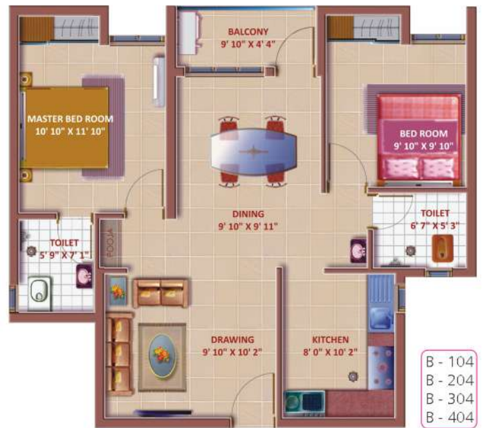
TYPICAL FLOOR PLAN : 1001 SFT (2 BHK APARTMENT)