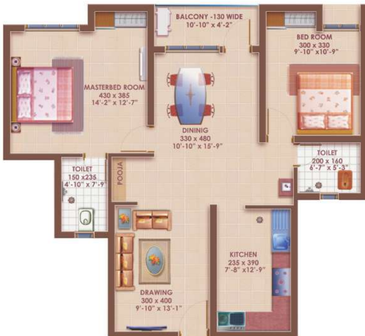
TYPICAL FLOOR PLAN : 1191 SFT (2 BHK APARTMENT)