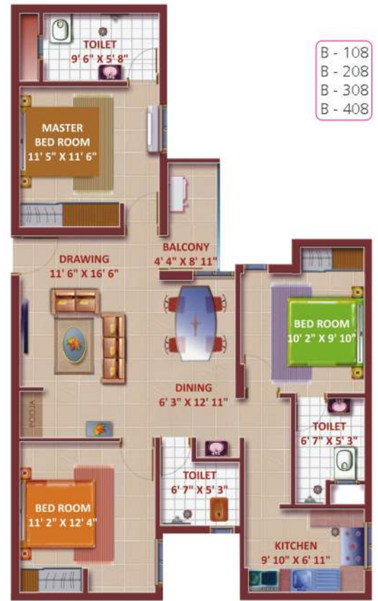
TYPICAL FLOOR PLAN : 1254 SFT (3 BHK APARTMENT)