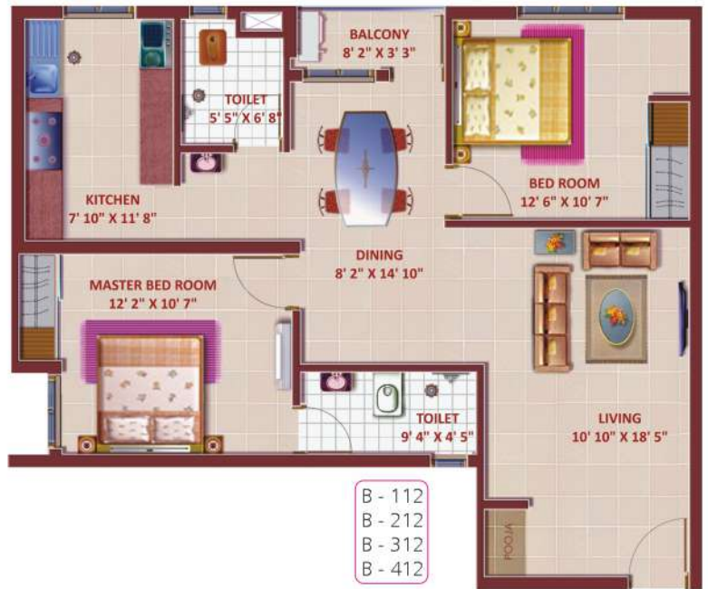
TYPICAL FLOOR PLAN : 1127 SFT (2 BHK APARTMENT)