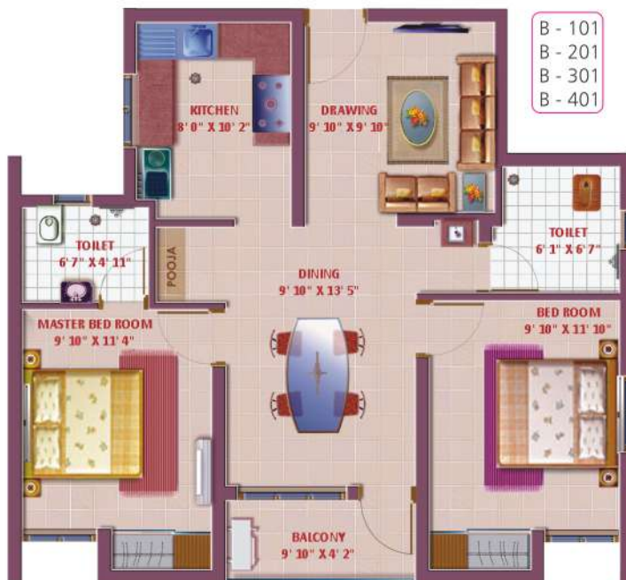
TYPICAL FLOOR PLAN : 990 SFT (2 BHK APARTMENT)