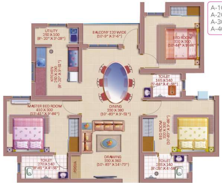
TYPICAL FLOOR PLAN : 1260 SFT (3 BHK APARTMENT)