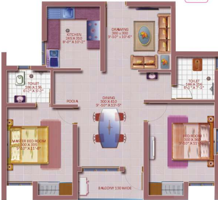
TYPICAL FLOOR PLAN : 1024 SFT (2 BHK APARTMENT)