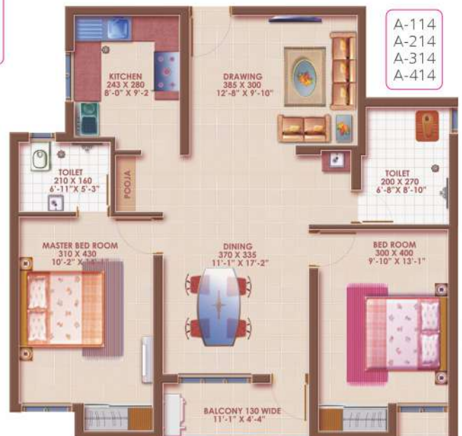
TYPICAL FLOOR PLAN : 1172 SFT (2 BHK APARTMENT)